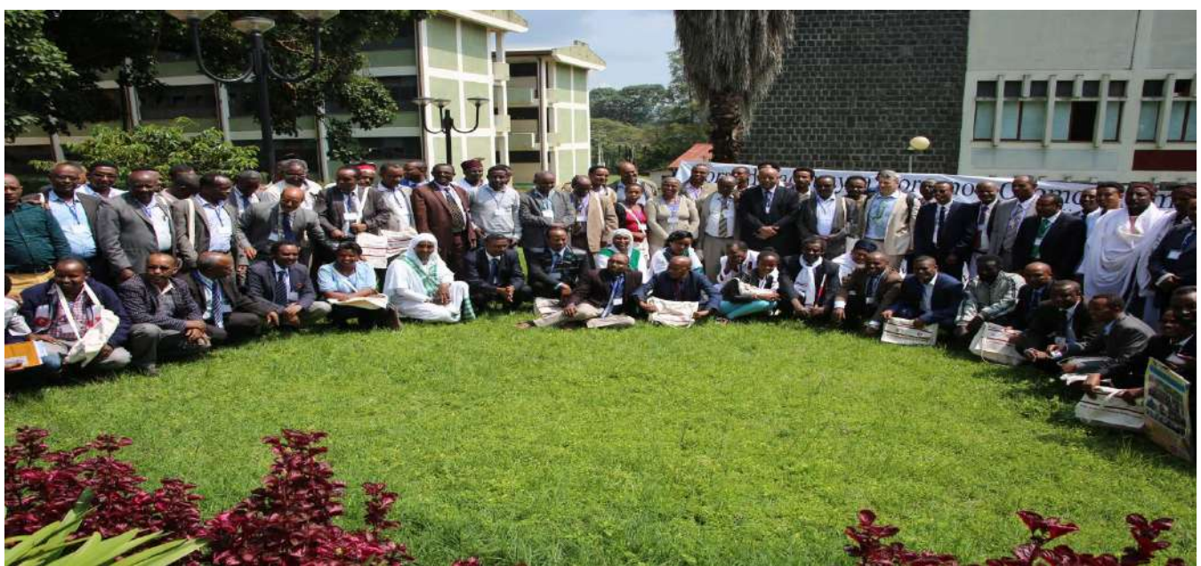
1-2 June 2017 Jimma, Oromia, Ethiopia