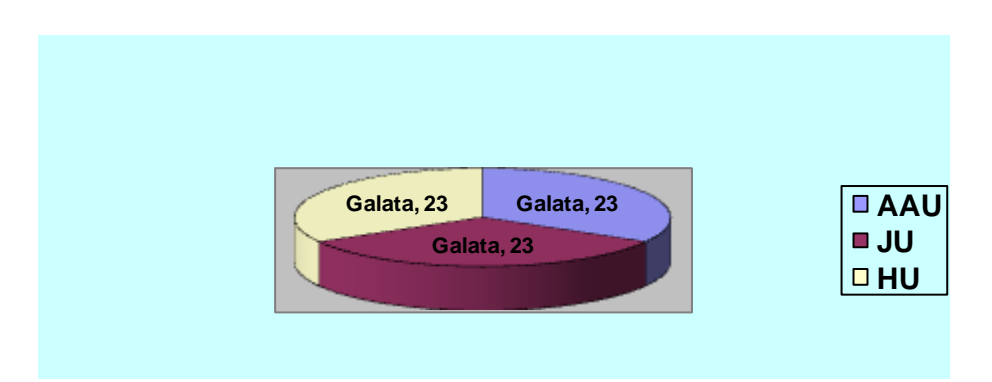
Figure 2. The Afan Oromo term used by students for "Acknowledgment".